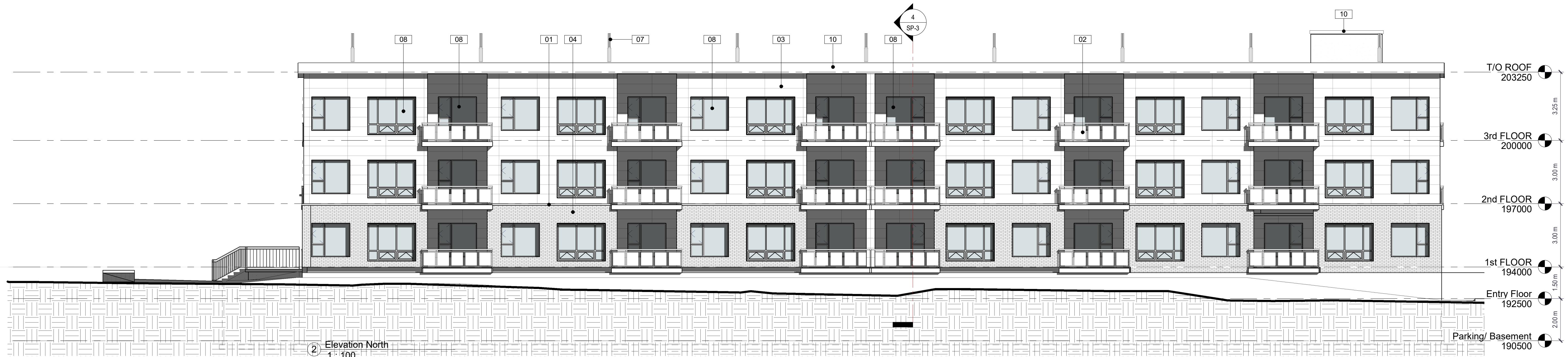
2 Elevation North 1 : 100