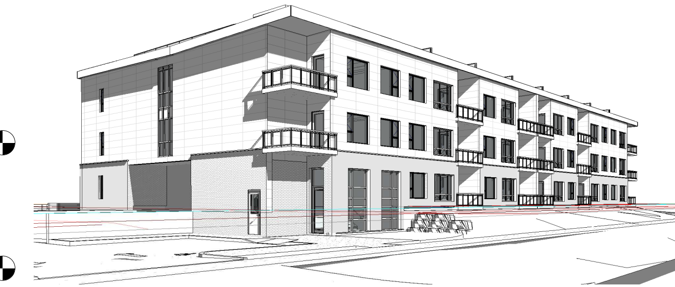
5 View From South-west