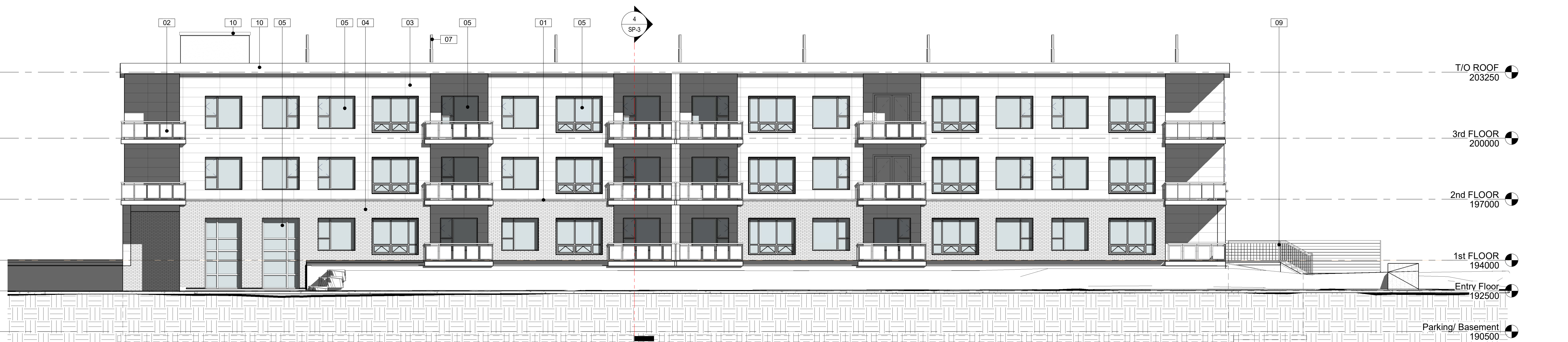
3 Elevation South 1 : 100