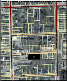
2 CONTEXT PLAN SCALE 1:1000