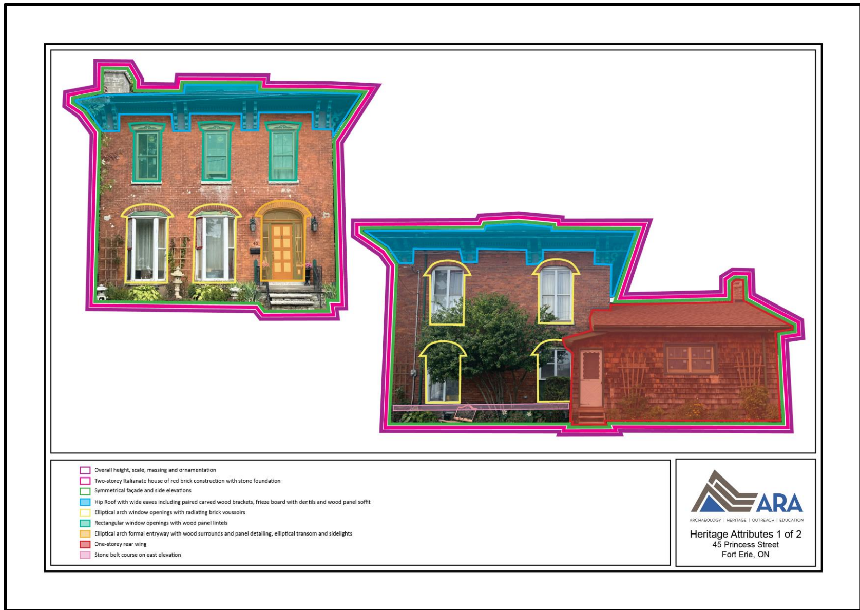
Map 3: Map of Heritage Attributes of 45 Princess Street