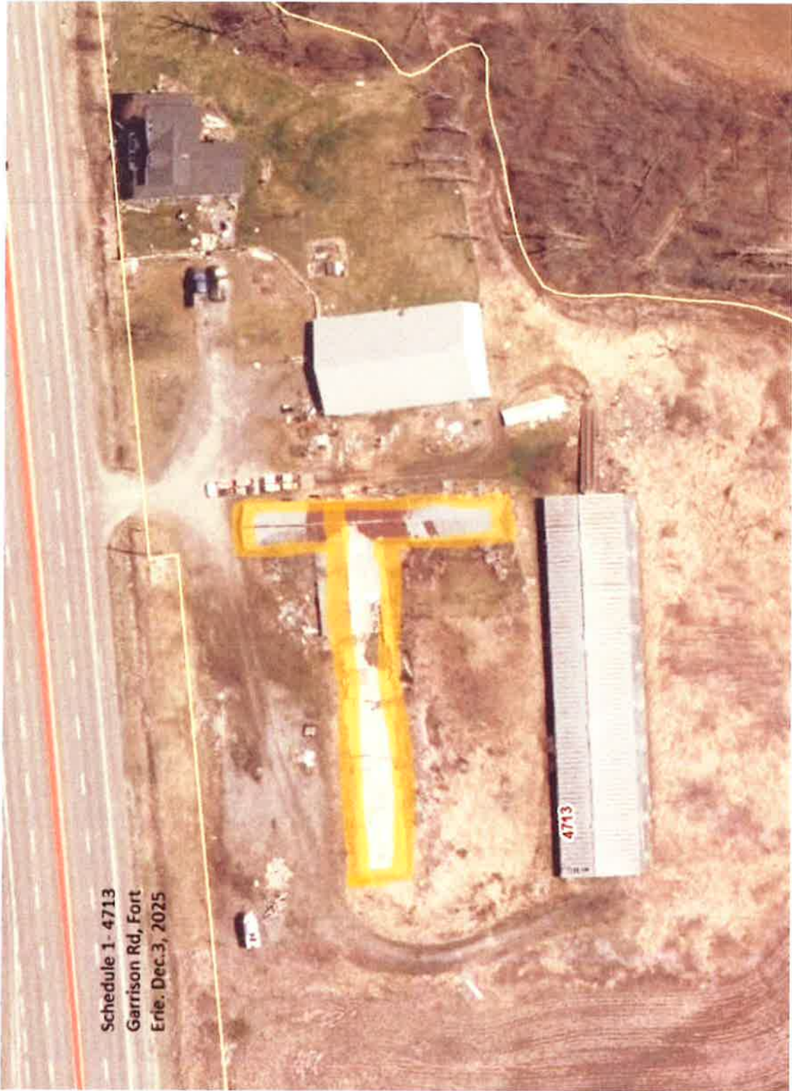
Schedule 1 - 4713 Garrison Rd, Fort Erle, Dec. 3, 2025